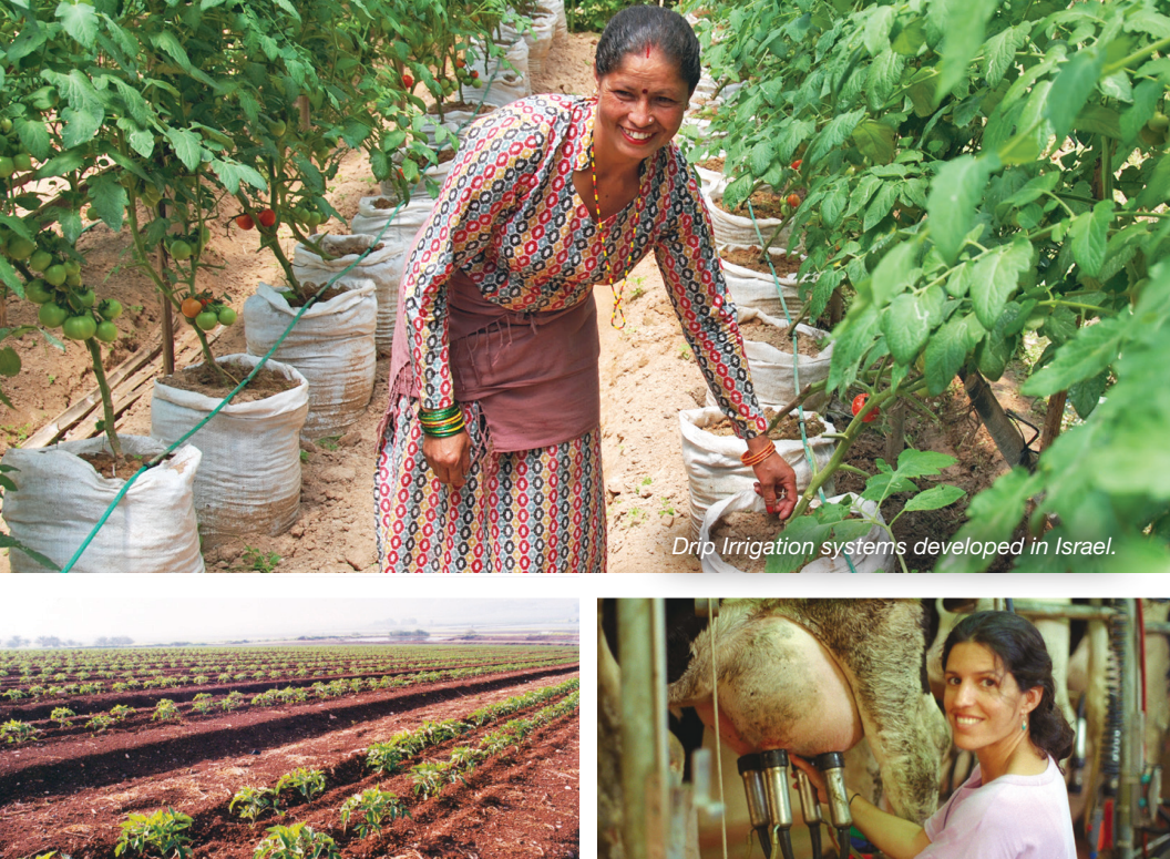
Above: Crops irrigated by recycled wastewater.